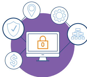
Fraud & Security